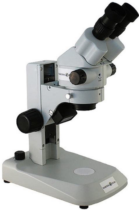
BL Compact LED Stand