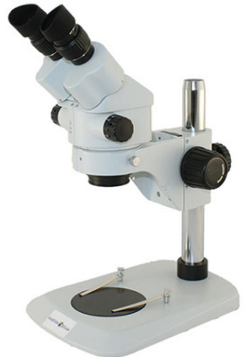
SPS Post Stand