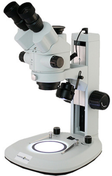
RLT LED Stand