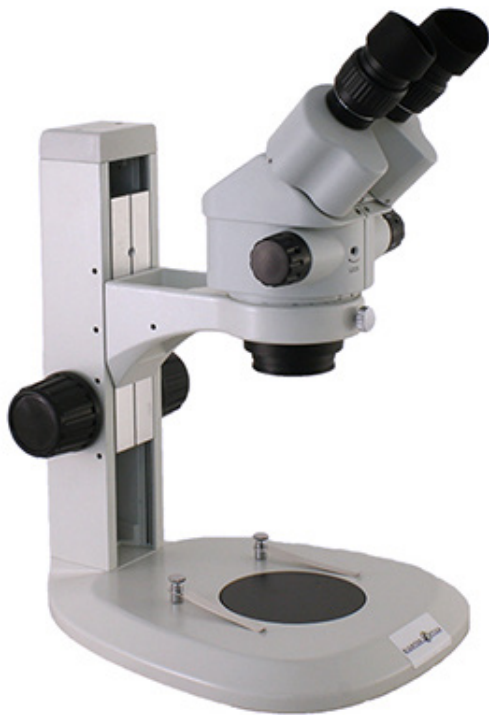
TS Track Stand